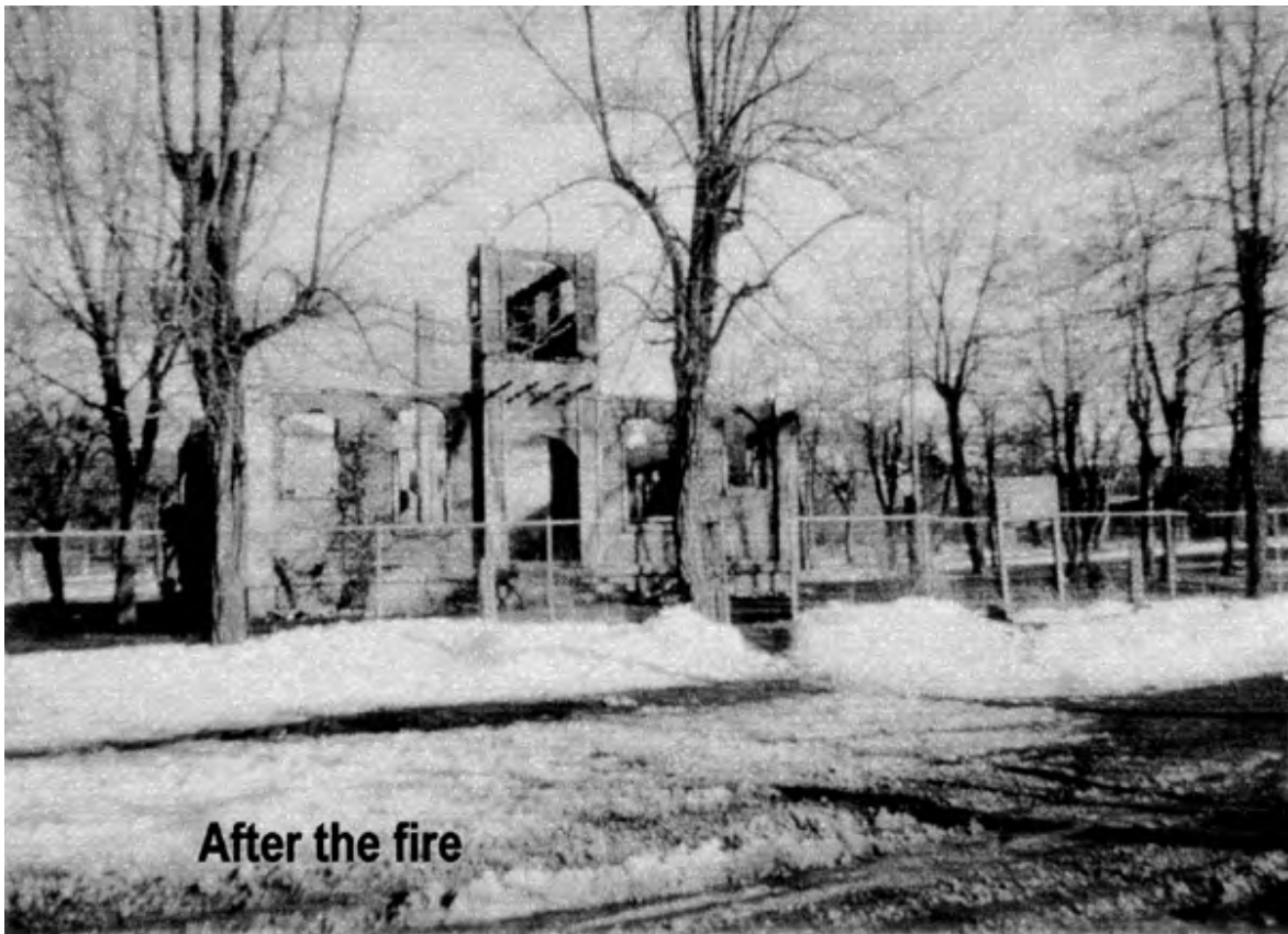
Feb. 7, 1946