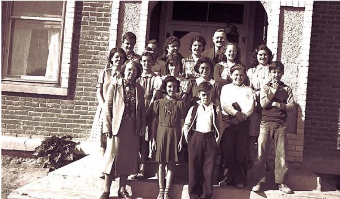
Class. ca. 1935.