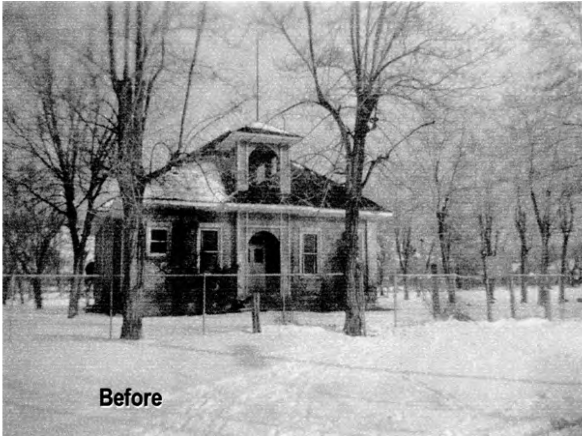
Before the fire in 1946.