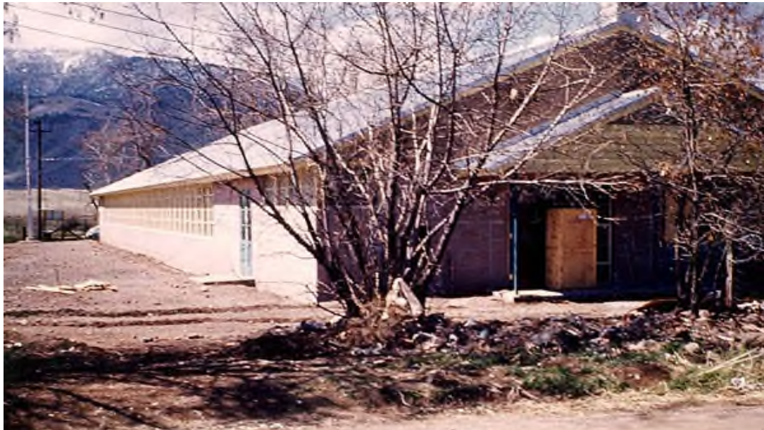
North and East facing sides of school, date unknown.