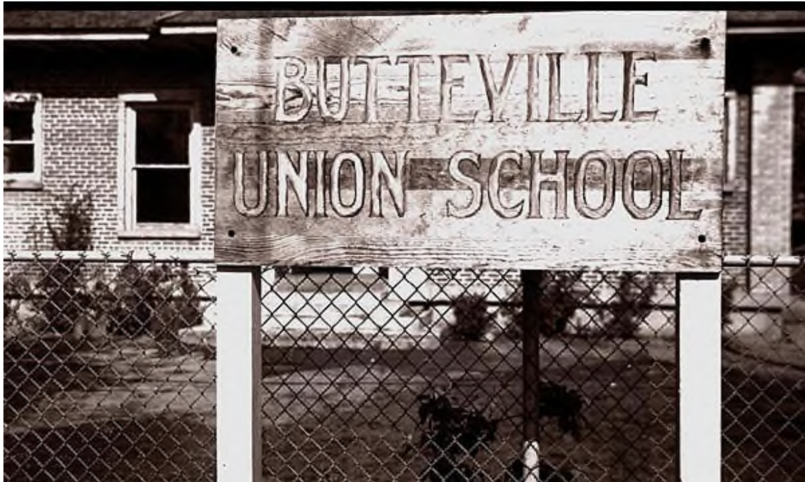
School sign, ca. 1935.