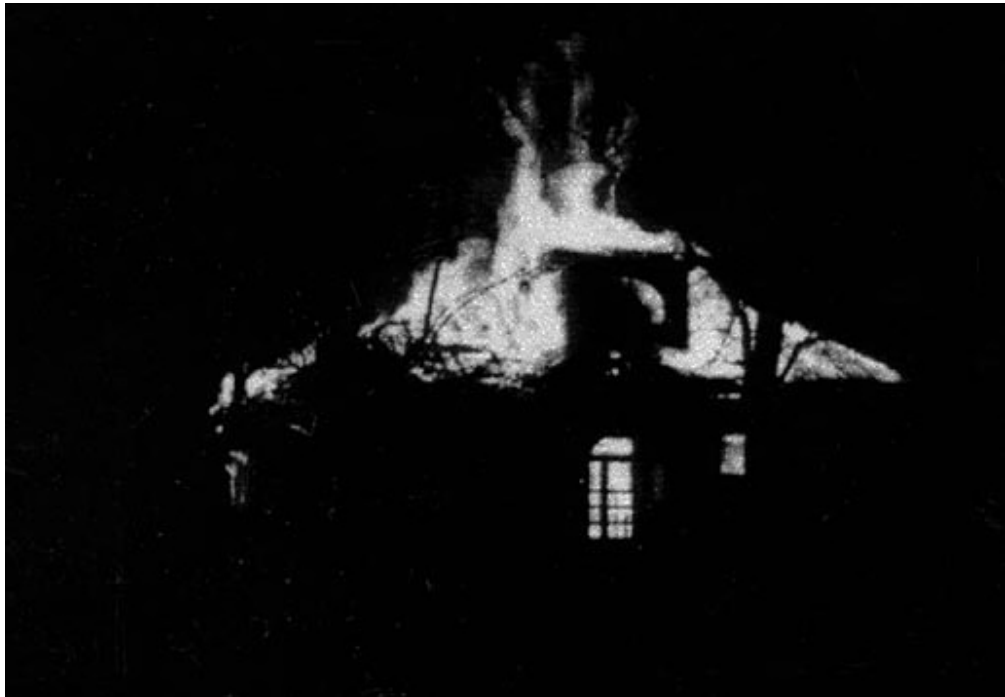
Feb. 6, 1946