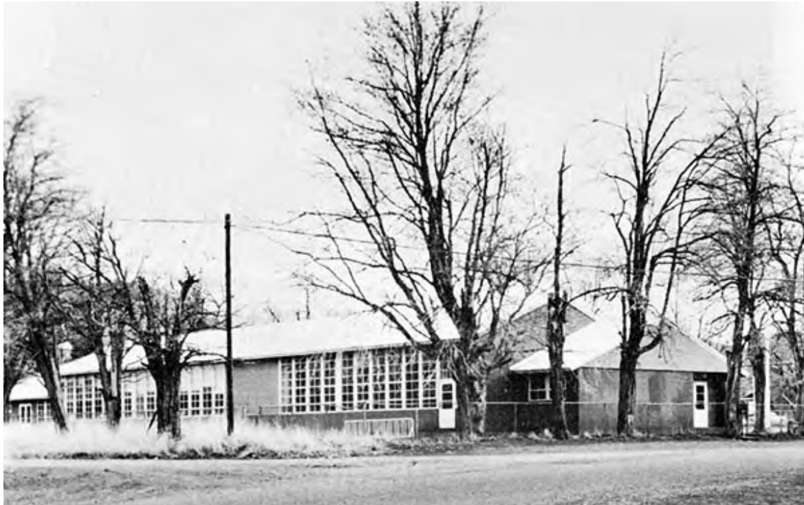
North and West facing sides. ca. 1950.