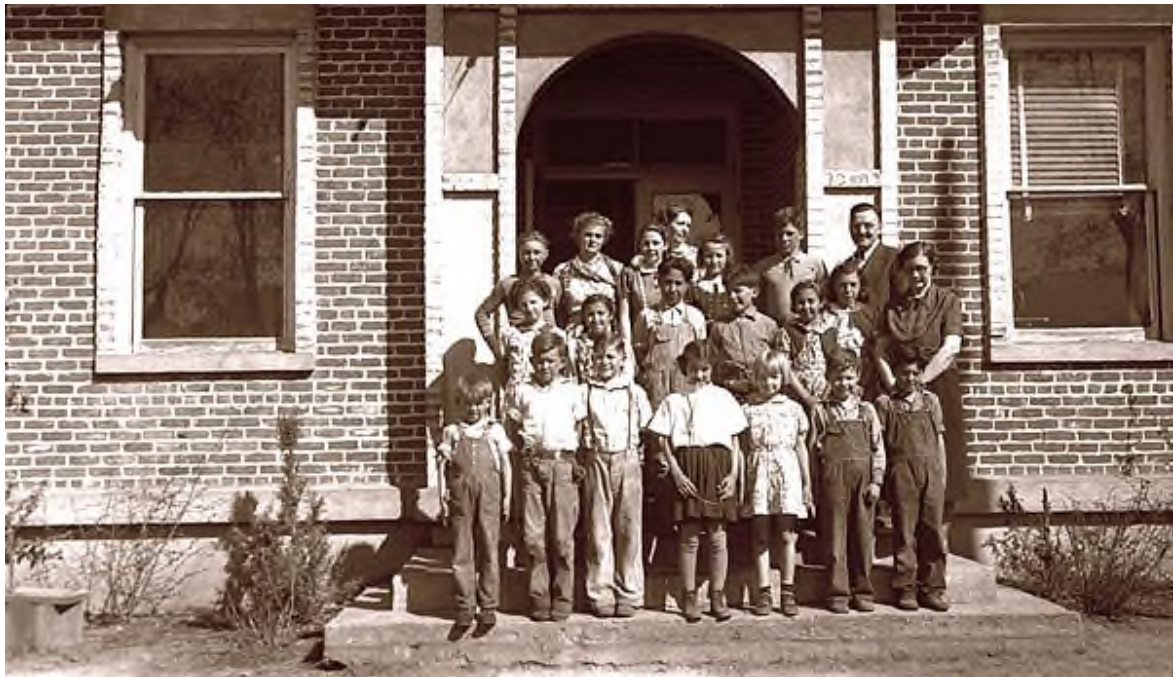
Class. ca. 1935.