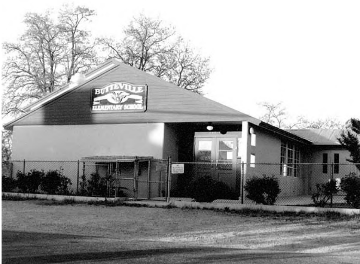
Date unknown.