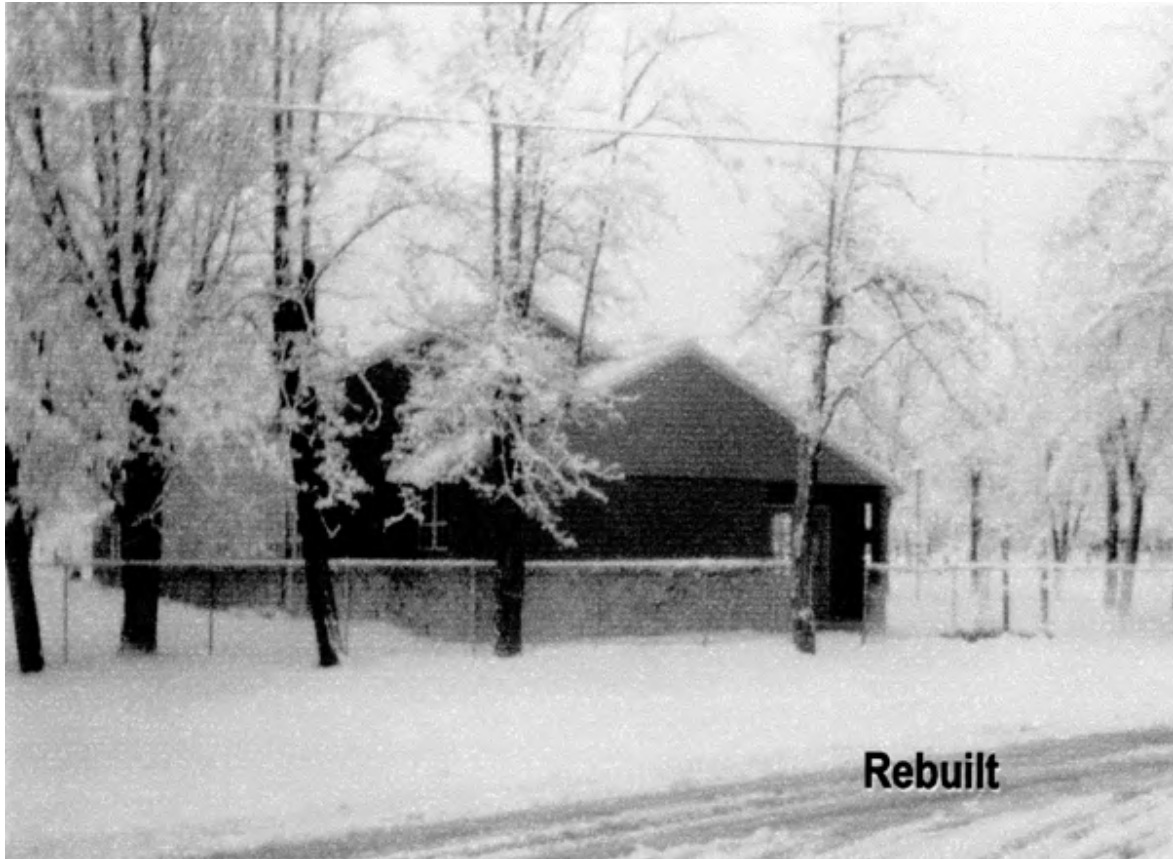
Rebuilt after the fire. , ca. 1948