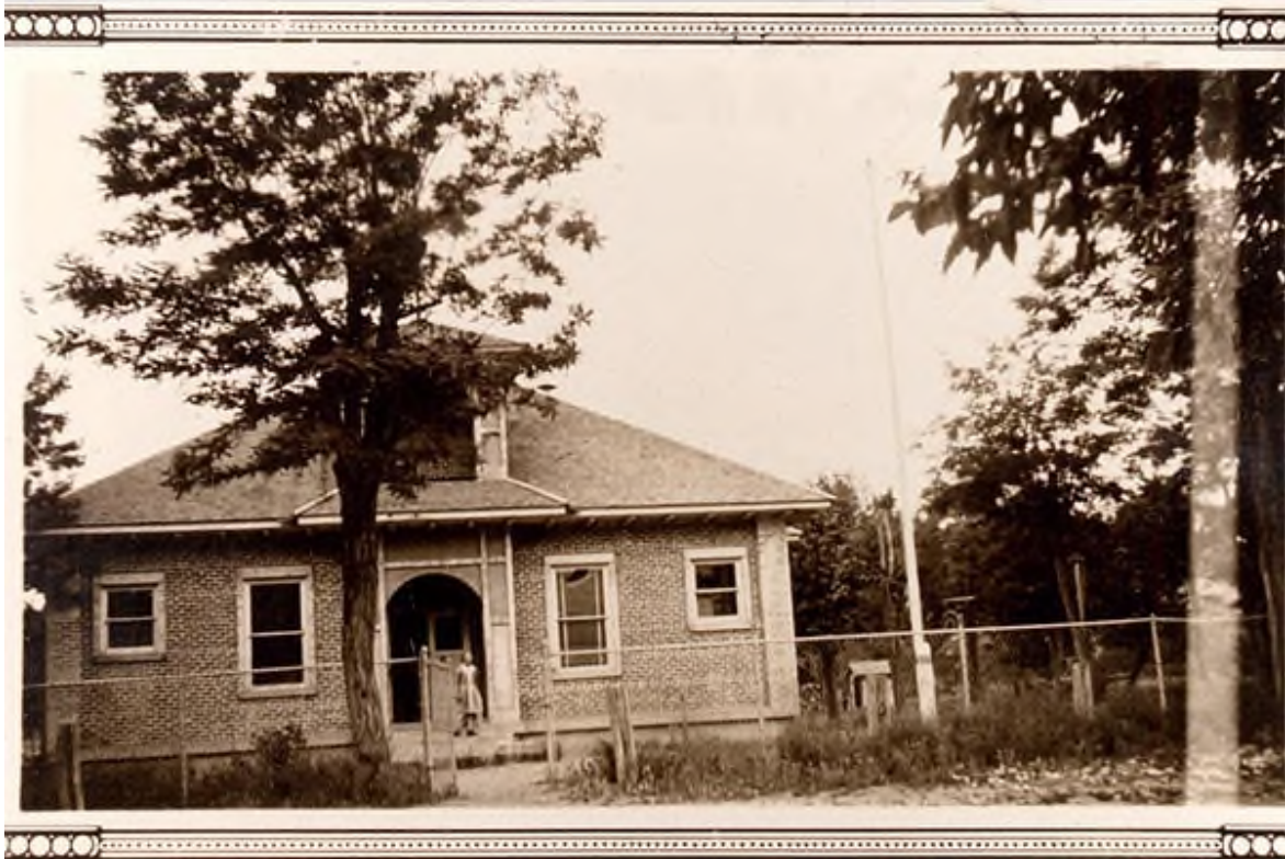
ca. 1935.