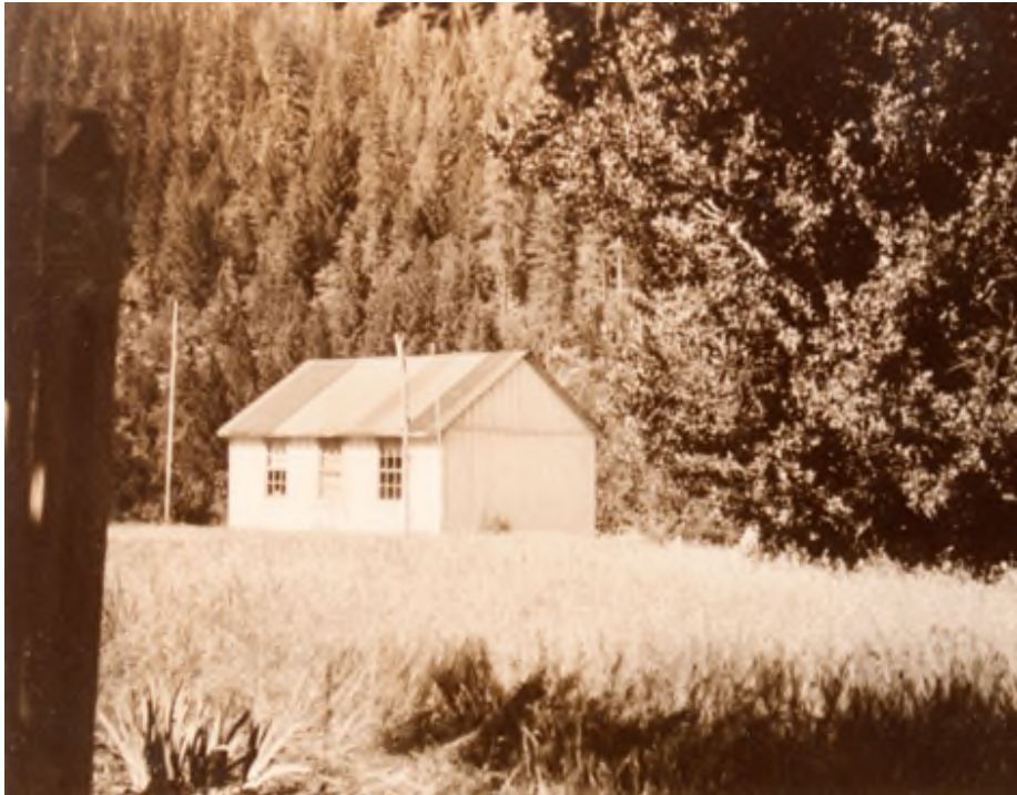
ca. 1935.