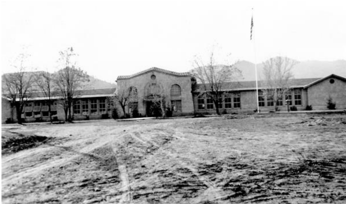
Yreka Elementary School, date unknown.