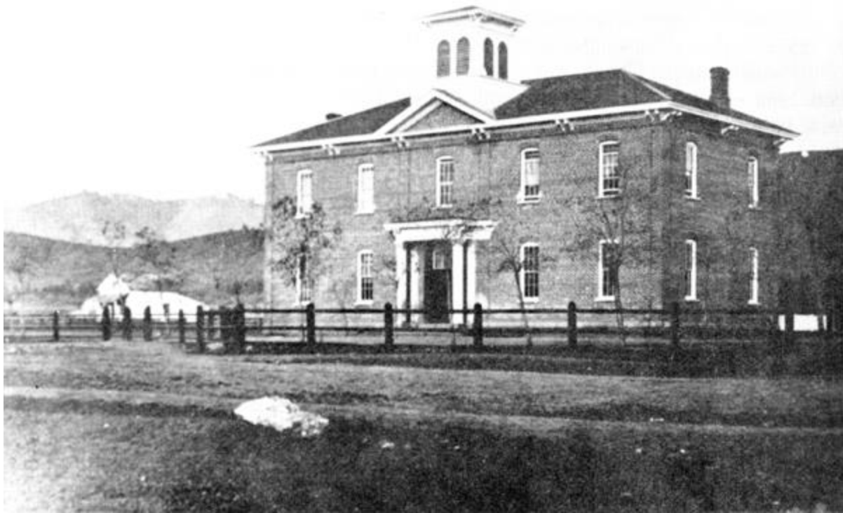
Yreka Elementary School, date unknown. Siskiyou County Office of Education School History Collection.