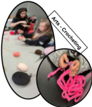
Arts - Crocheting