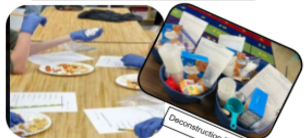
Deconstruction Pie Making