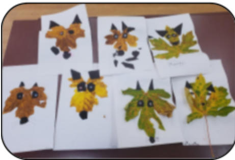
Science - Leaf Foxes

Lots of STEAM activities were engaged during the month of November.