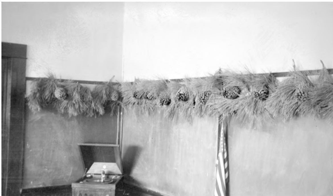
Classroom, date unknown.