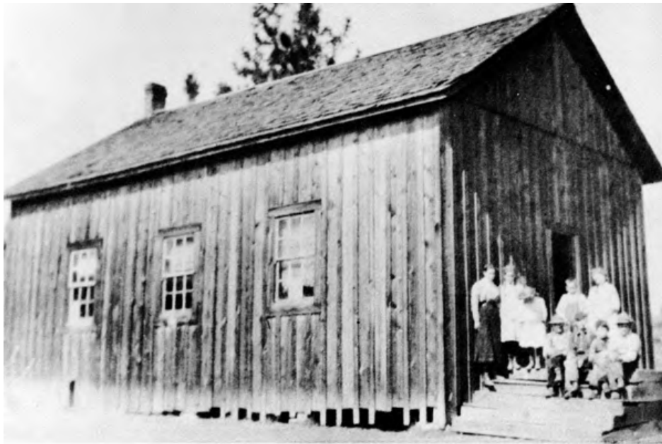
East Fork School - 1890

February 14, 1961 – Unionized with Callahan (27-10)