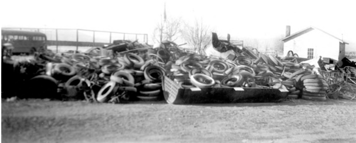
Rubber tire drive during WWII, ca. 1942.