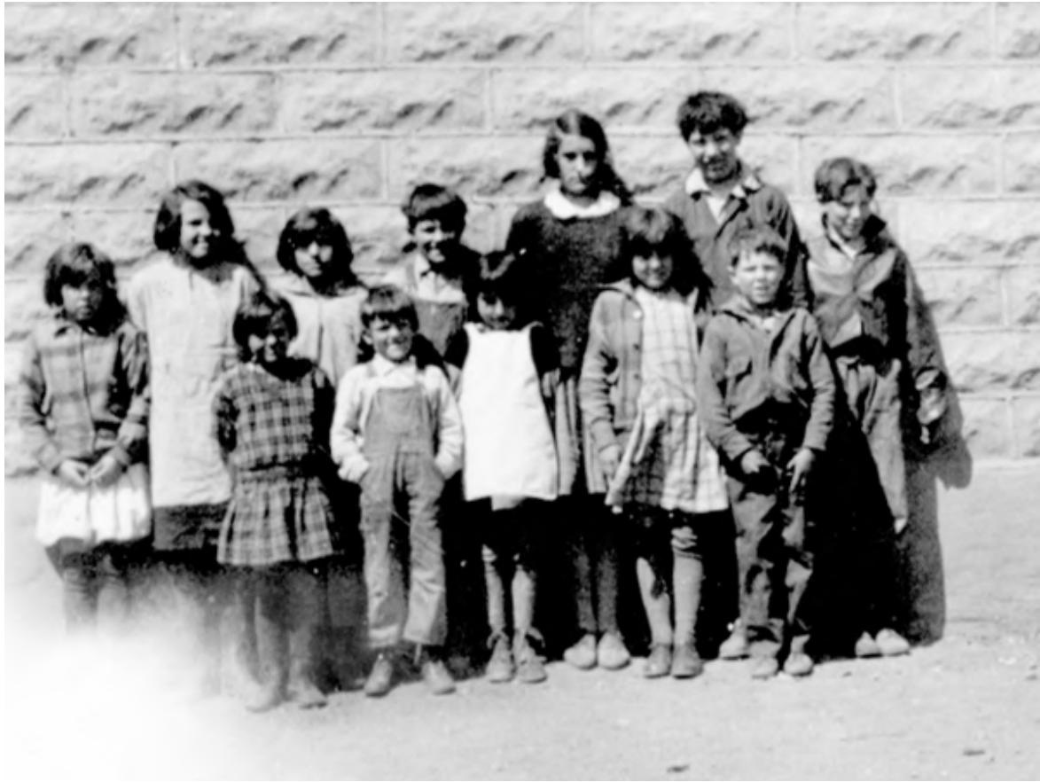
School children, 1929.