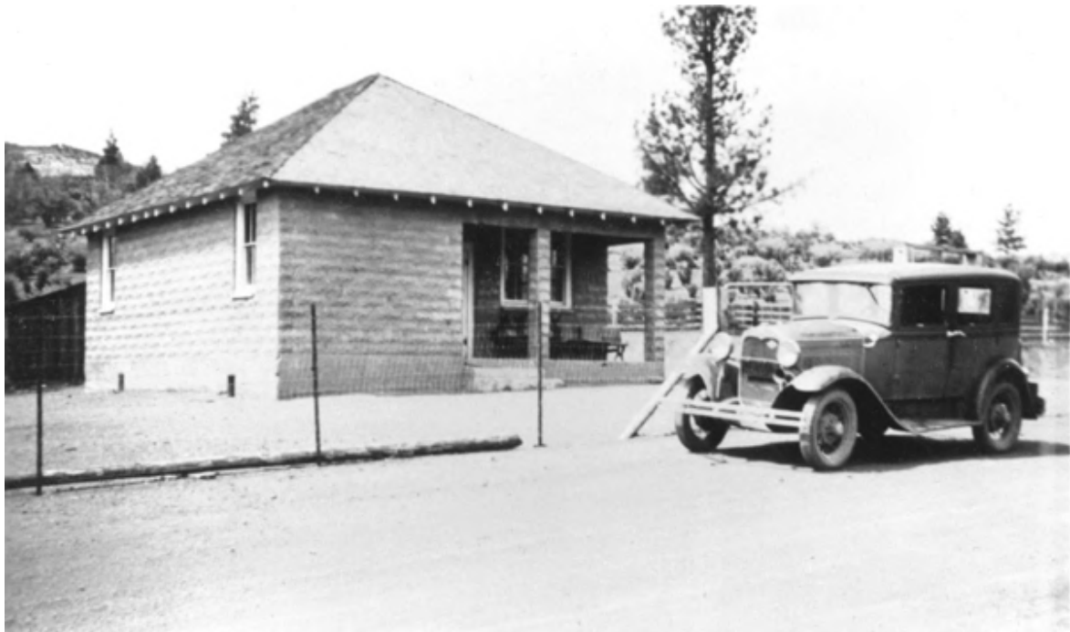
ca. 1935.