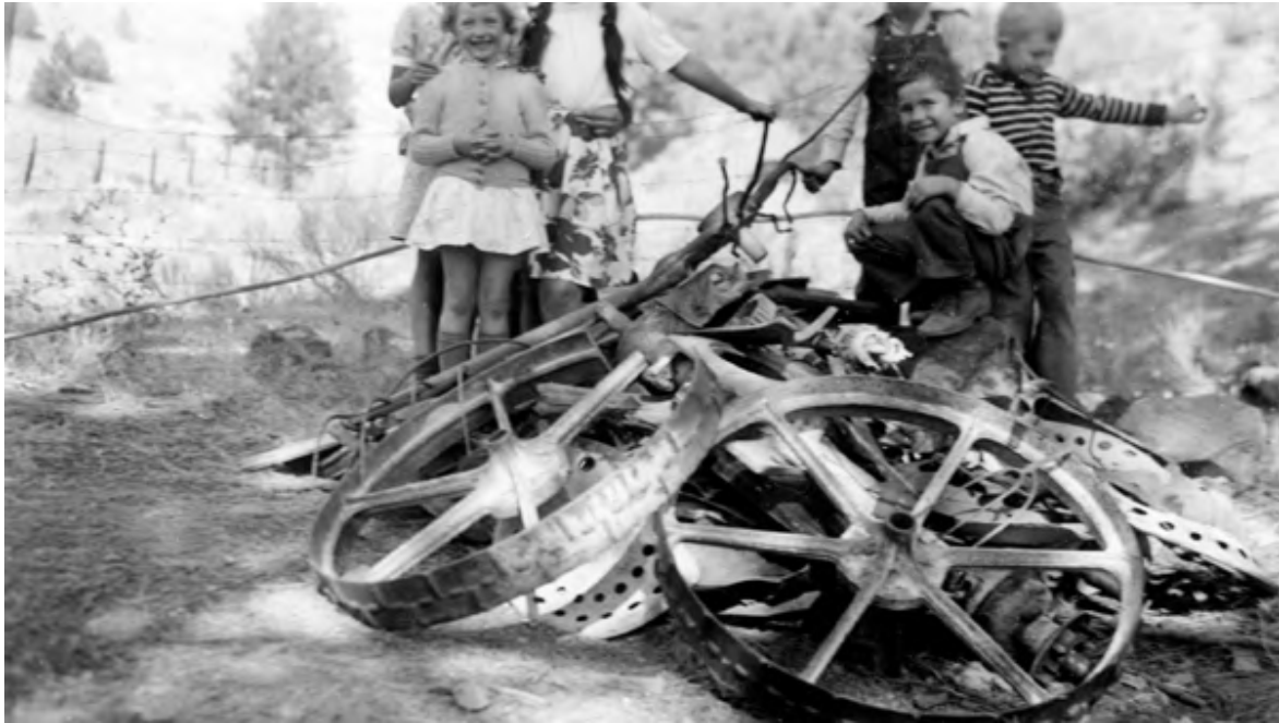
Scrap metal drive for WWII, ca. 1942.