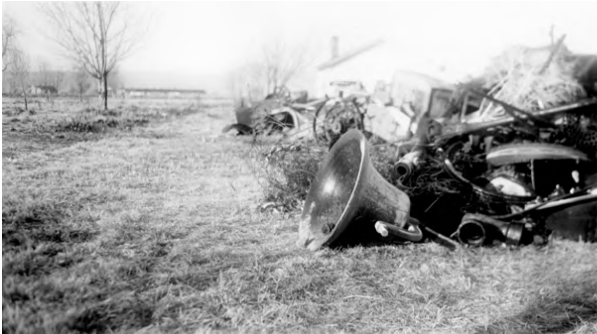
Scrap metal drive during WWII, ca. 1942. Siskiyou County Office of Education School History Collection.