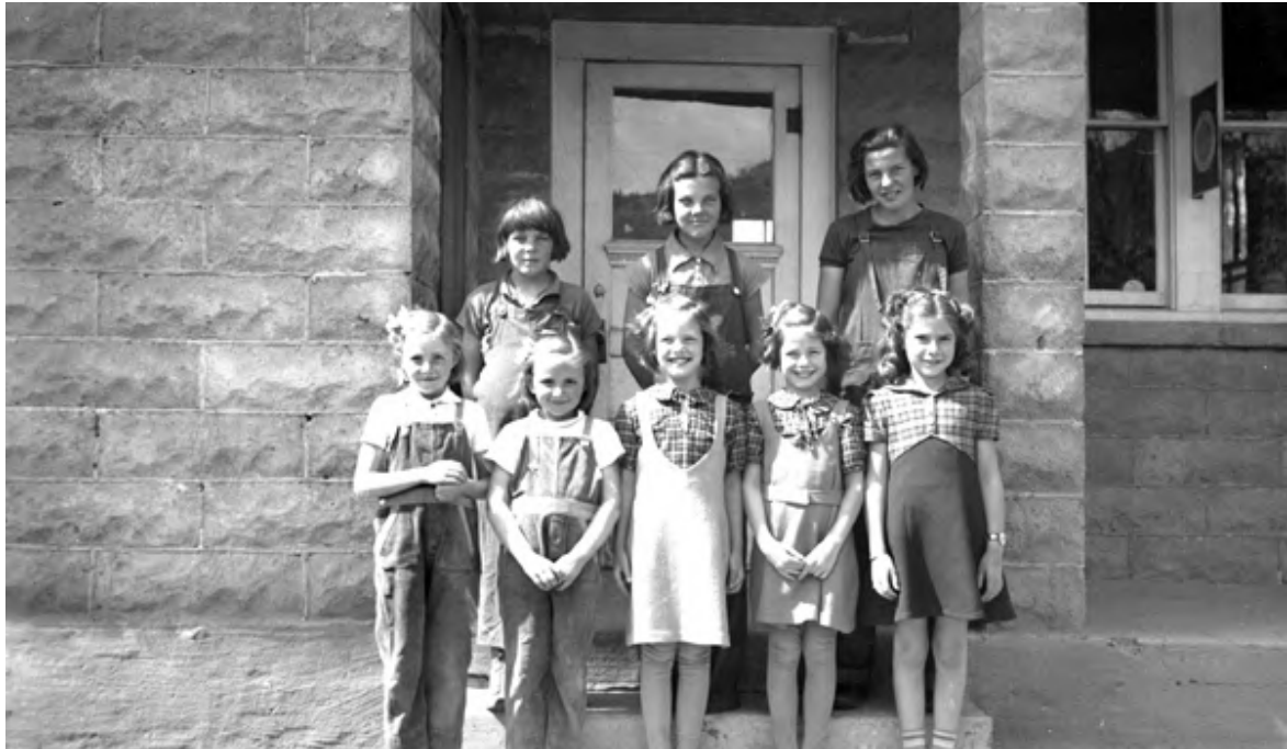
Students, date unknown. Siskiyou County Office of Education School History Collection.