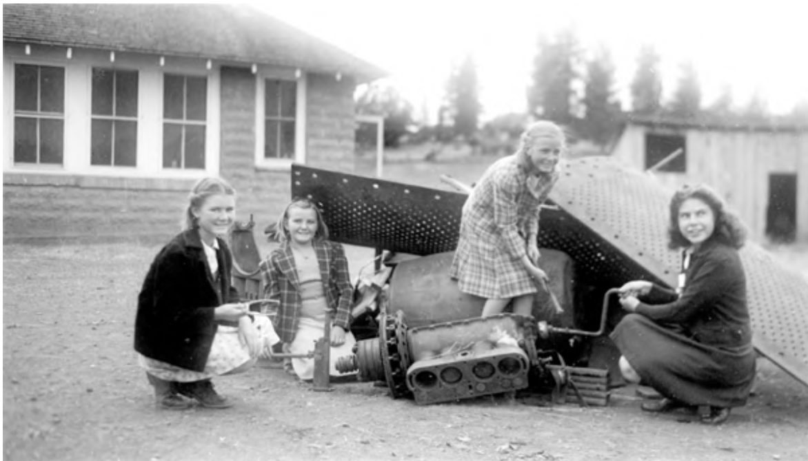
East Fork students collecting scrap metal, 1942.