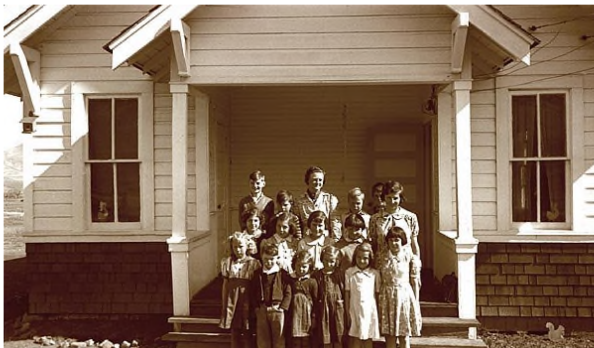
Date unknown.

December 18, 1946 – All bids for sale rejected (20-200)