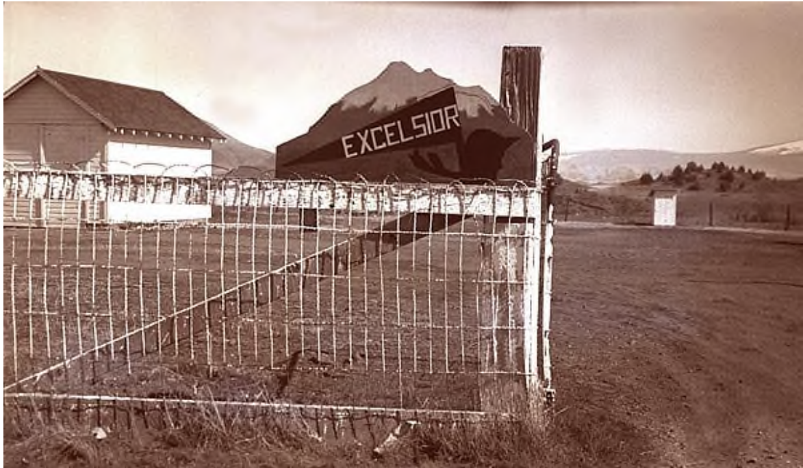
School sign, date unknown. Siskiyou County Office of Education School History Collection.