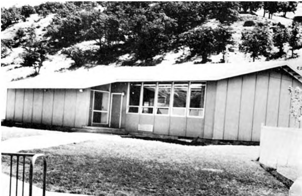
ca. 1965.