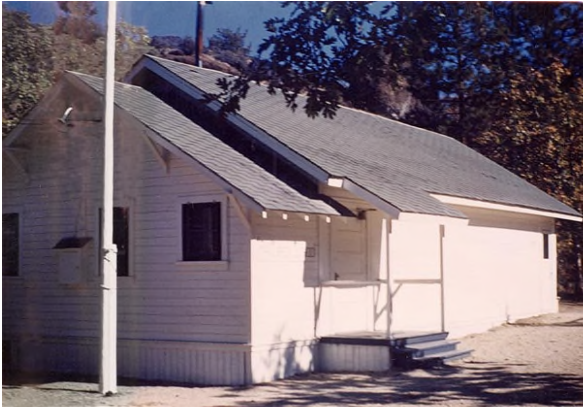
ca. 1940.