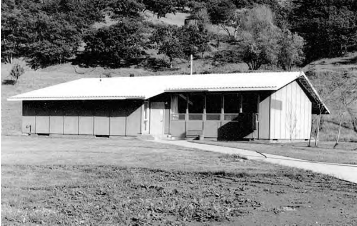
Date unknown. Siskiyou County Office of Education School History Collection.