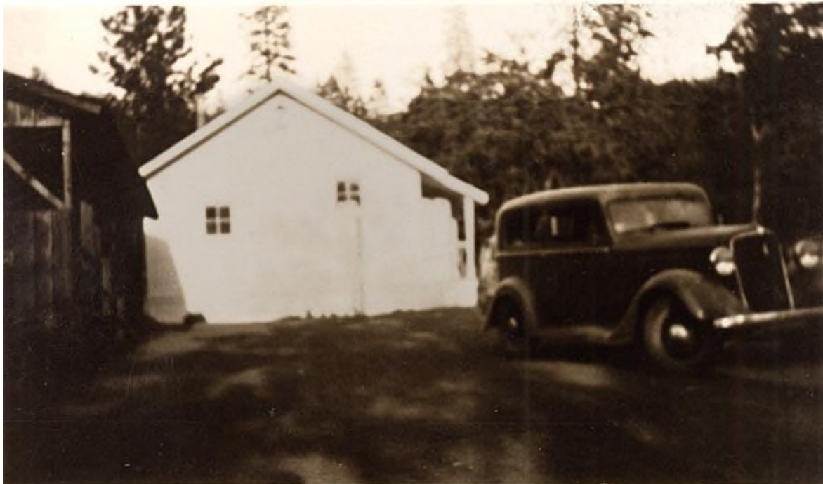
The old school, ca. 1935.