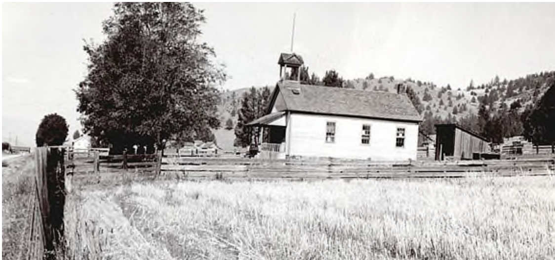
Date unknown. Siskiyou County Office of Education School History Collection.

March 5, 1929 – Authorization to sell school house (15-163)