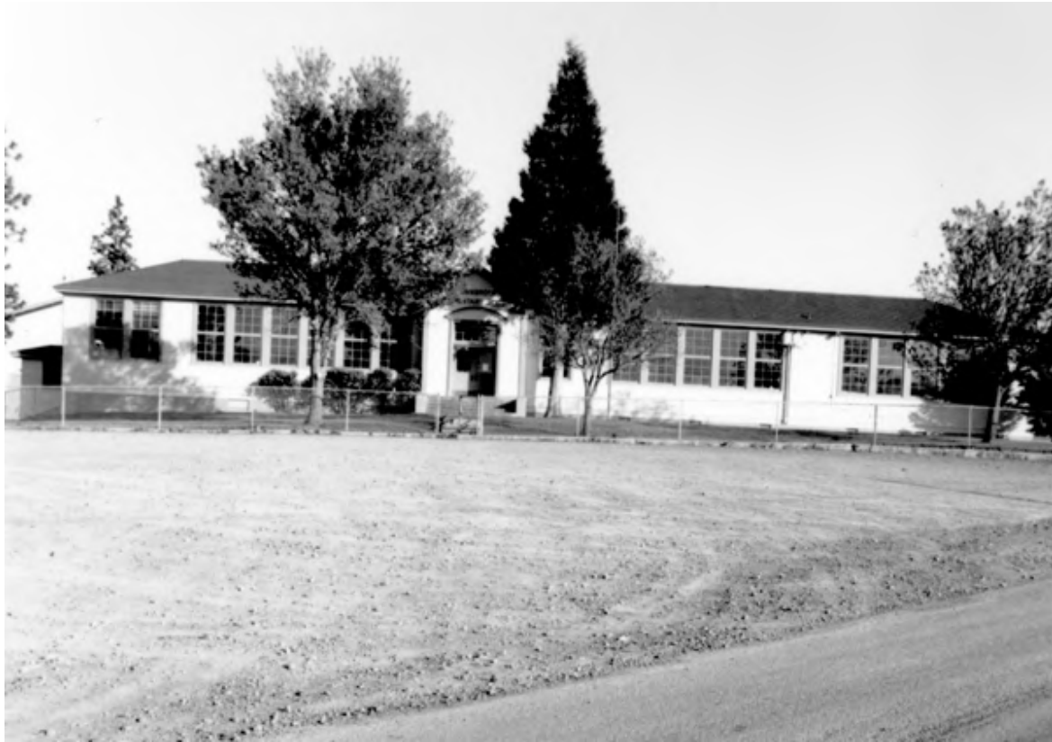
ca. 1975. Siskiyou County Office of Education School History Collection.