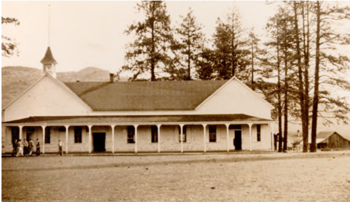
Old Cottonwood School, (aka Hornbrook) ca. 1935.