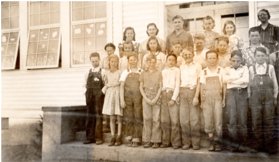
Hornbrook class, ca. 1939.