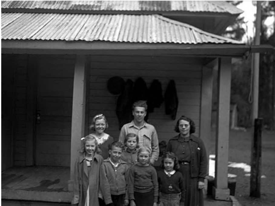
Students, date unknown. Siskiyou County Office of Education School History Collection.