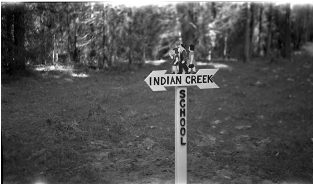
School road sign, date unknown. Siskiyou County Office of Education School History Collection.