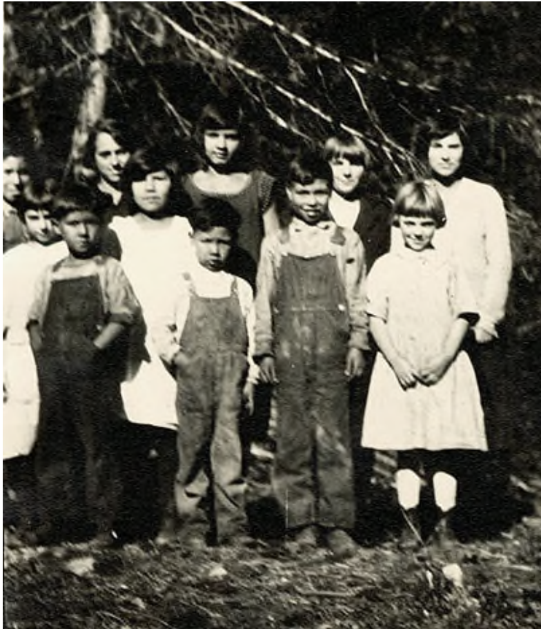
Students, 1929.