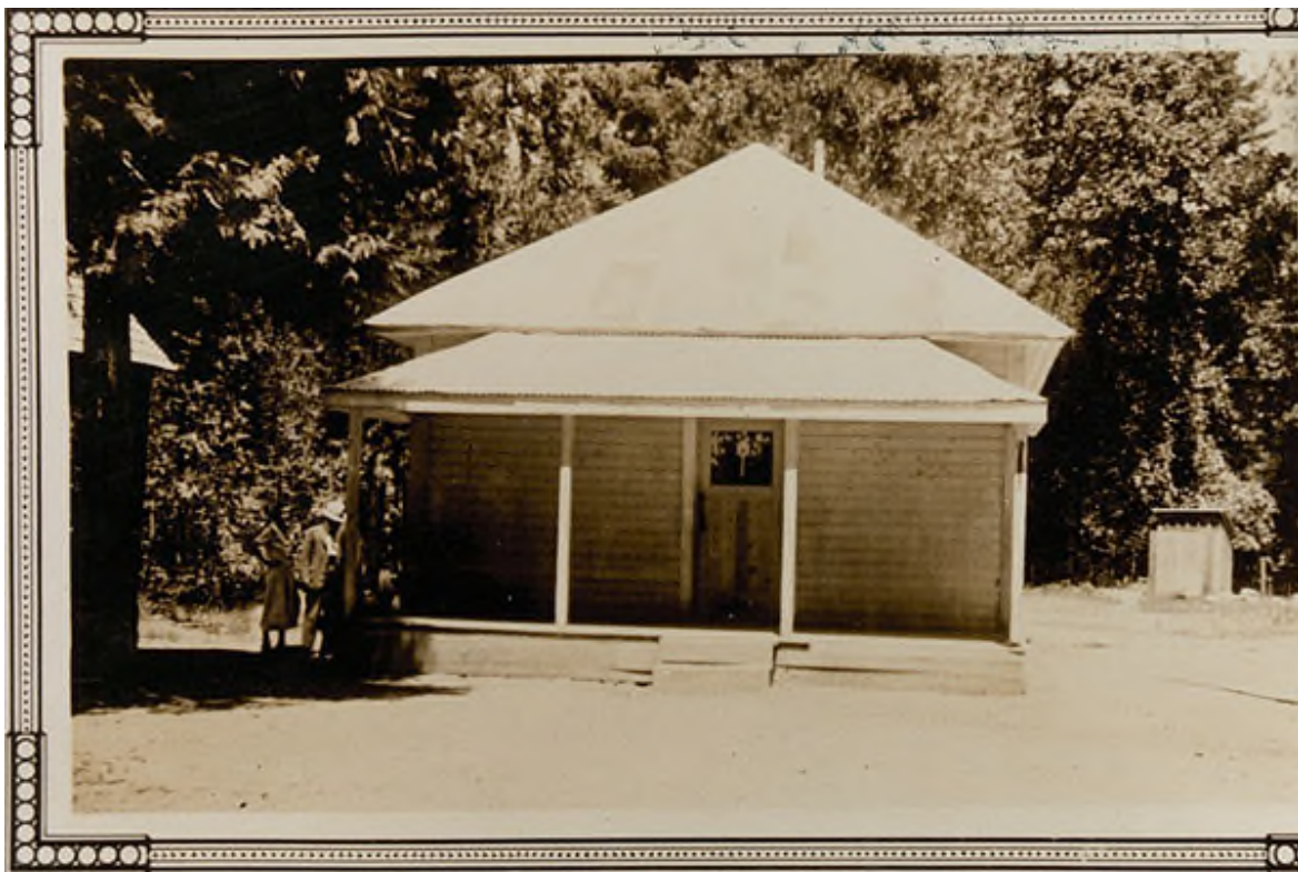
ca. 1935.