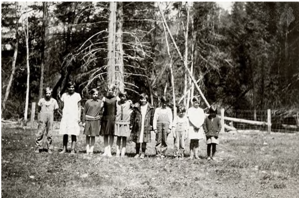
Students, 1929. Loaned by the Siskiyou County Public Library.