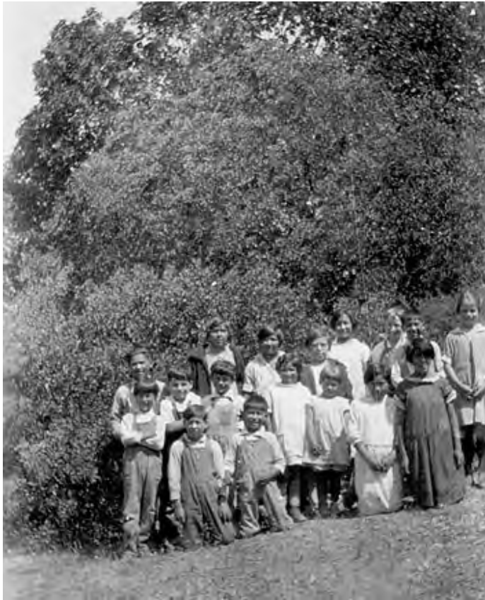
Students, 1929.