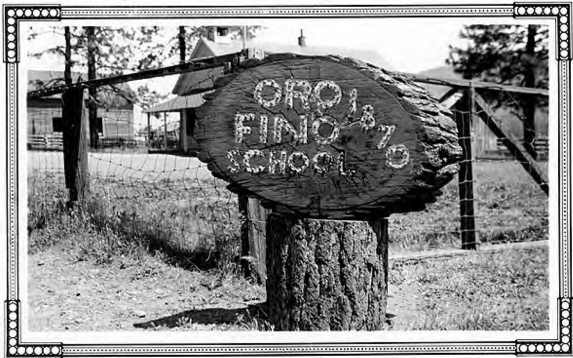
School sign, ca. 1940.