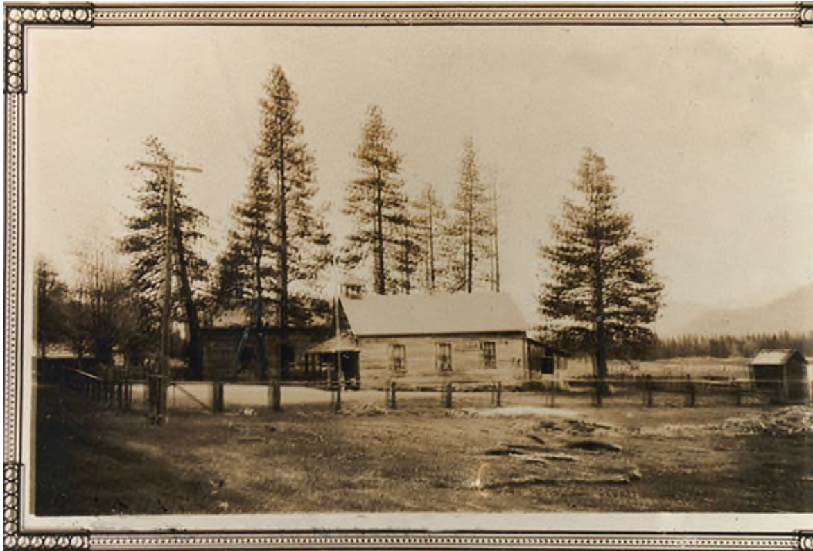
ca. 1935. (NOTE: photo is a double exposure)