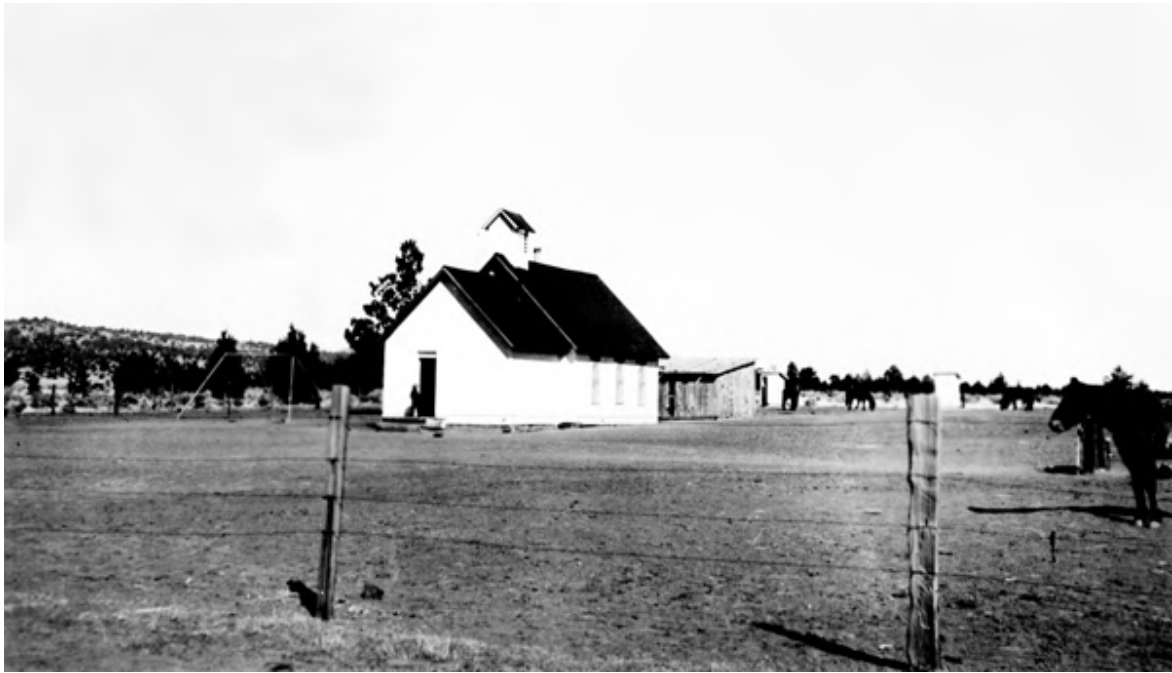
ca. 1939.