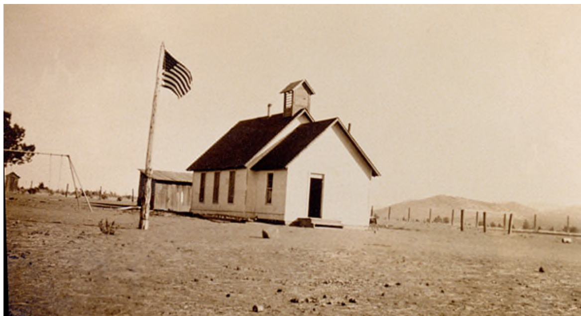
Red Rock School, ca. 1935.

August 14, 1962 – District lapsed and annexed to the Macdoel District (27-306)