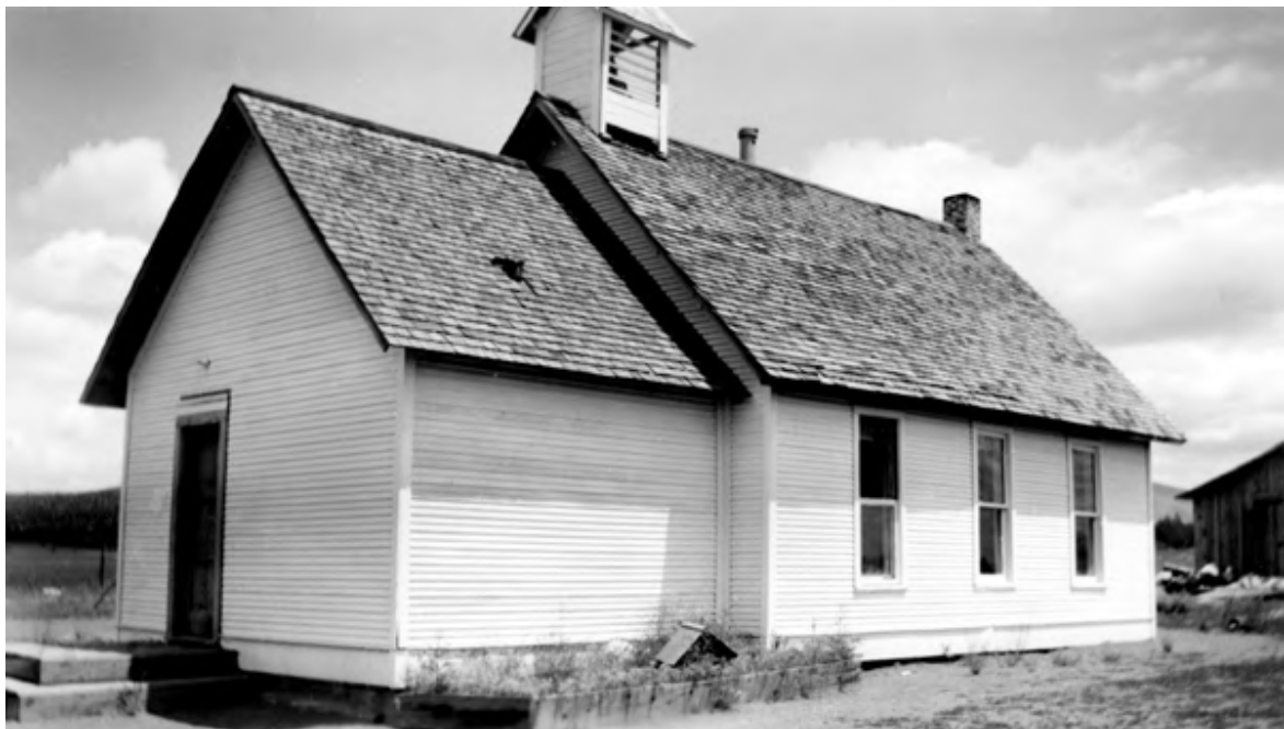
Date unknown.