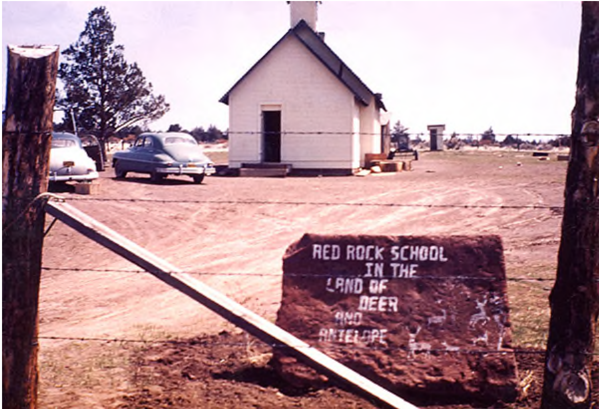
School and sign, ca. 1940.