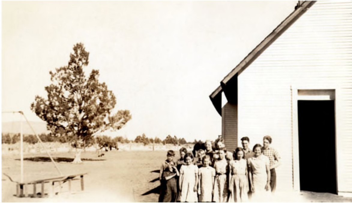
Red Rock School and class, ca. 1939.