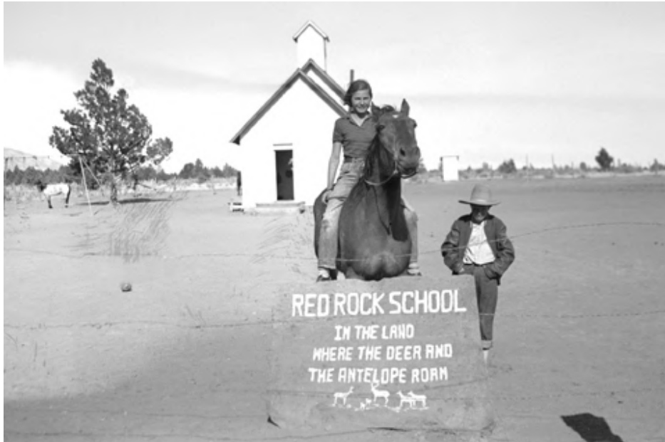
School sign, ca. 1939. Siskiyou County Office of Education School History Collection.